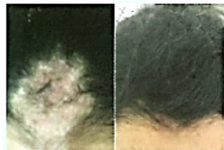
Fig. 5.6. Scalp scars treated with 1500 Biofibre® in 2 sessions

Some patients experienced minor skin reactions; seborrhea and sebum plugs that were controlled and the fibres fall rate found in this study was 20% on average annually. This study showed that Biofibre hair implants can be used as an adjunctive treatment for scalp scars. [10]