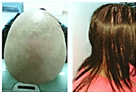
Fig. 5.7. Female patient implanted with 25.000 Biofibre® in 15 sessions