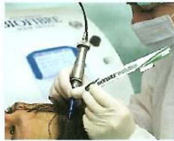
Fig. 5.1. Automatic Biofibre® hair Implant Device

reduction of the operation time with minimization of trauma and enhancement of implant precision. [1,8]