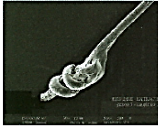
Fig. 5.5. Reversible knot of Biofibre® after extraction. No residues stay embedded in the scalp allowing prompt scalp healing.