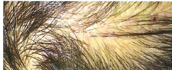
Fig. 5.4. Local infection and inflammation after hair implantation