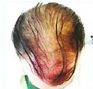
Fig. 5.3 Male patient implanted with 5000 Biofibre® in 5 sessions Figure copyright Biolife sas

Reproduced from JBRHA Vol. 30, no. 2 [S2], 21-25 [2016] by kind permission